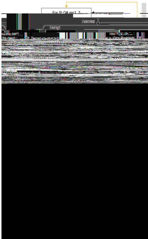
Fig. 1: Assessment and Continuous Improvement Processes

Several changes have been made to the assessment process including updating the list of target courses where the outcomes are assessed and 2 flowcharts (Figs. 1-2) to help guide the assessment and continuous improvement processes. In addition, the duration of the assessment cycle has been shortened from 3 years to 2.